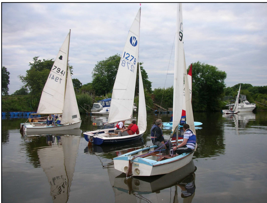
Becalmed on the Ouse, 8th July